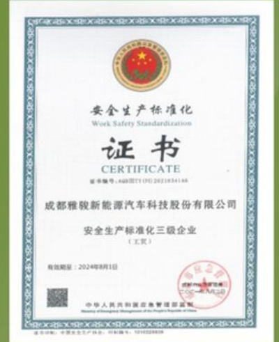
Certificate of Standardization of Safety Production Certification