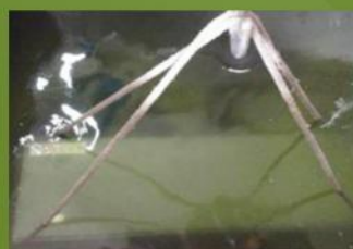
Seawater Immersion Test