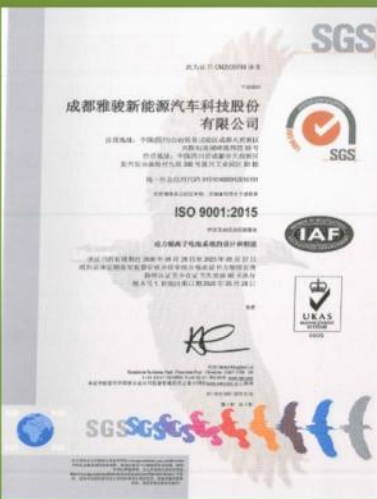
ISO 9001 Certification.