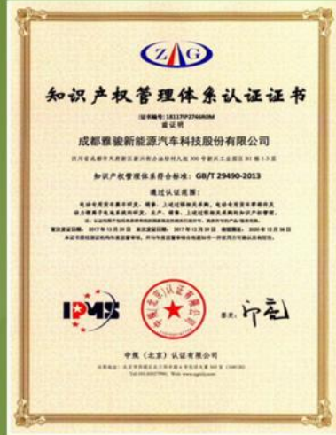
Certificate of Knowledge Product Management System Certification