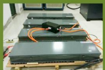
Charge & Discharge Test