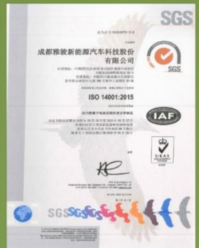
ISO 14001 Certification