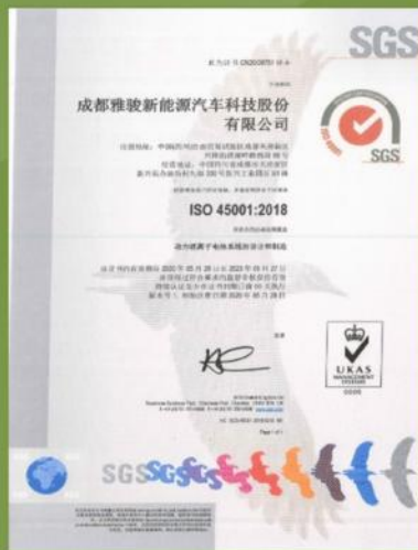
ISO 45001 Certification