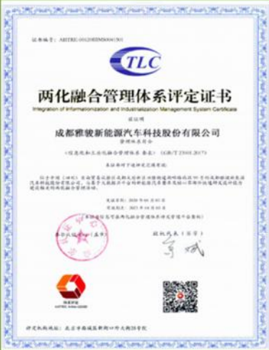
Certificate of Conformity of Integrated Management System for Informatization and Industrialization